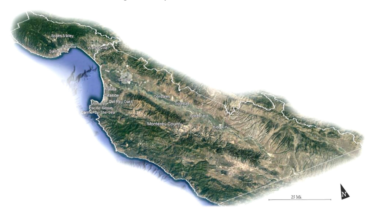
Figure 1: Map of AMBAG RHNA Area

Marina, Seaside, Sand City, Monterey, Pacific Grove, Carmel, and the County of Monterey. Also affected are the unincorporated communities of Aptos, Live Oak, Moss Landing, and Pebble Beach.